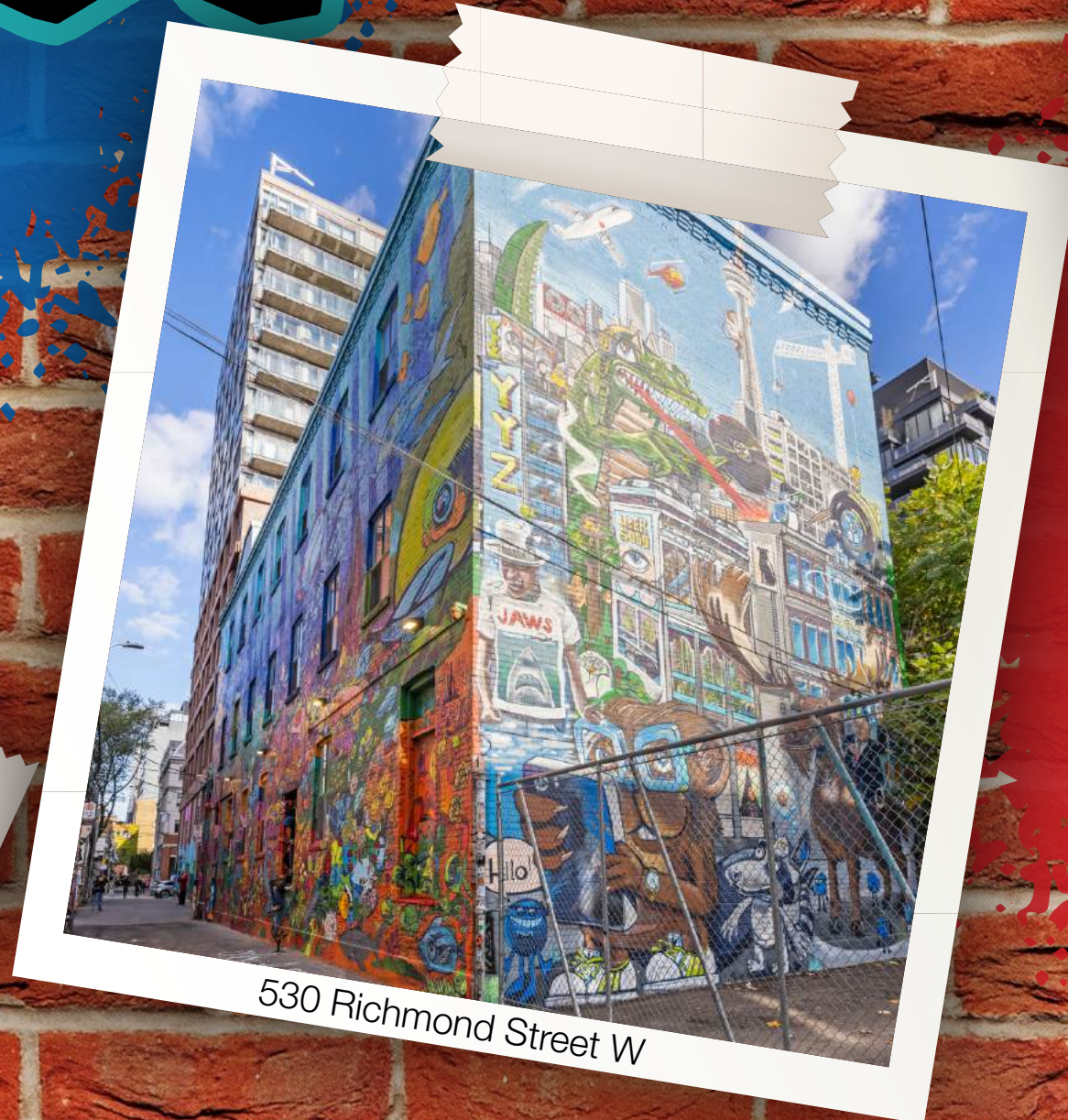
530 Richmond Street W