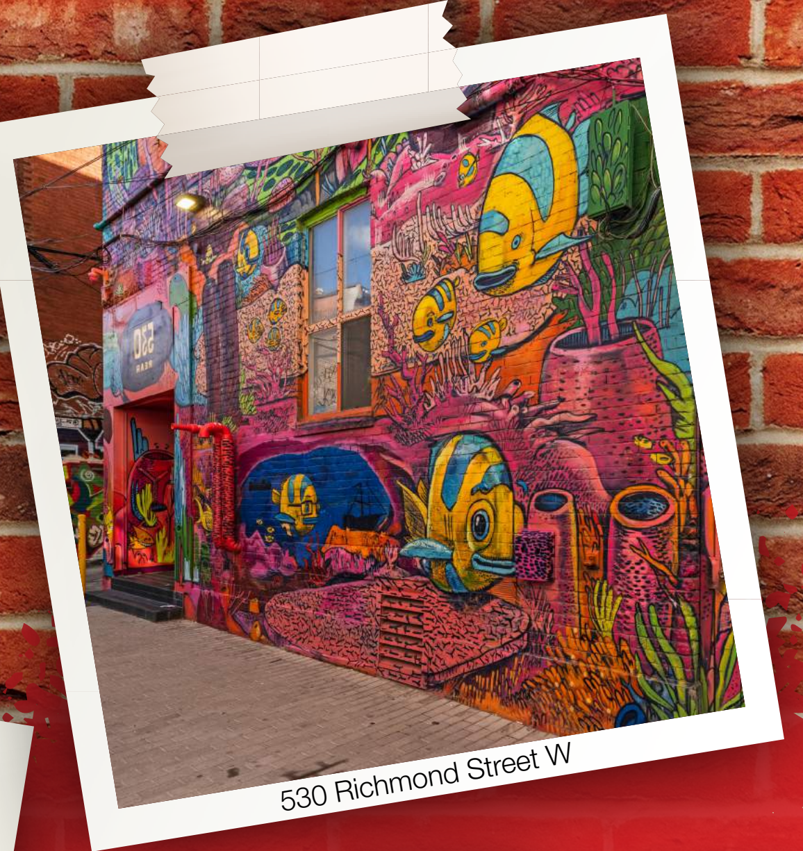
530 Richmond Street W