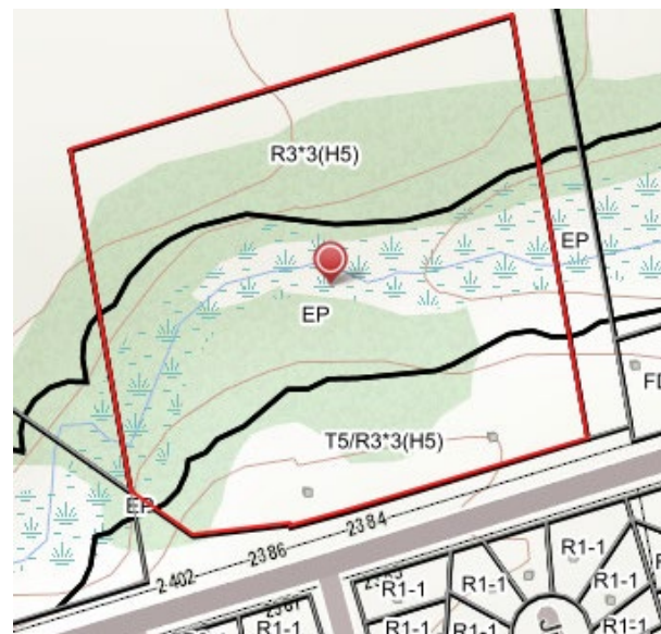
TABLE 6.6: STANDARDS FOR THE RESIDENTIAL THREE (R3) ZONE