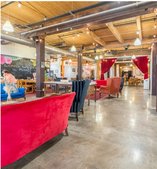
Ground Floor Lounge