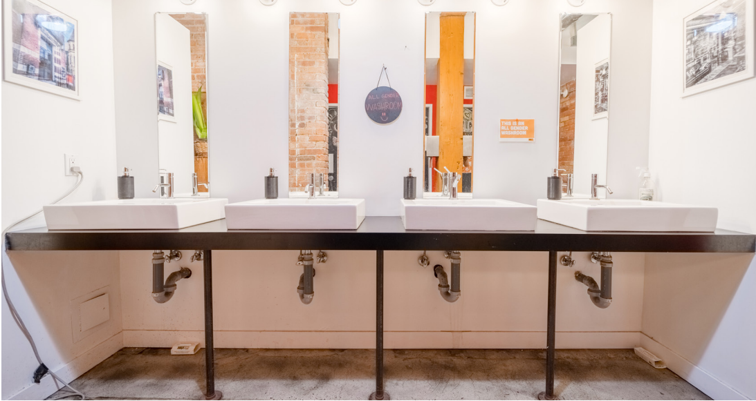
All Gender Washrooms