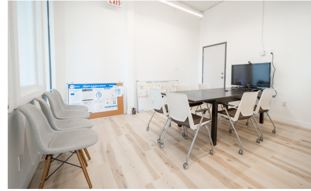
Boardroom inside Private Office

Discounted services from CSI partners Discounted private event space