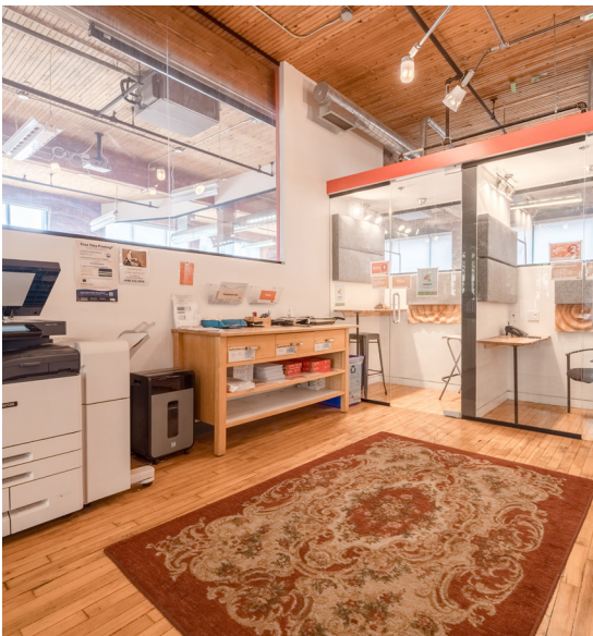
Copy/Print & Phone Booths