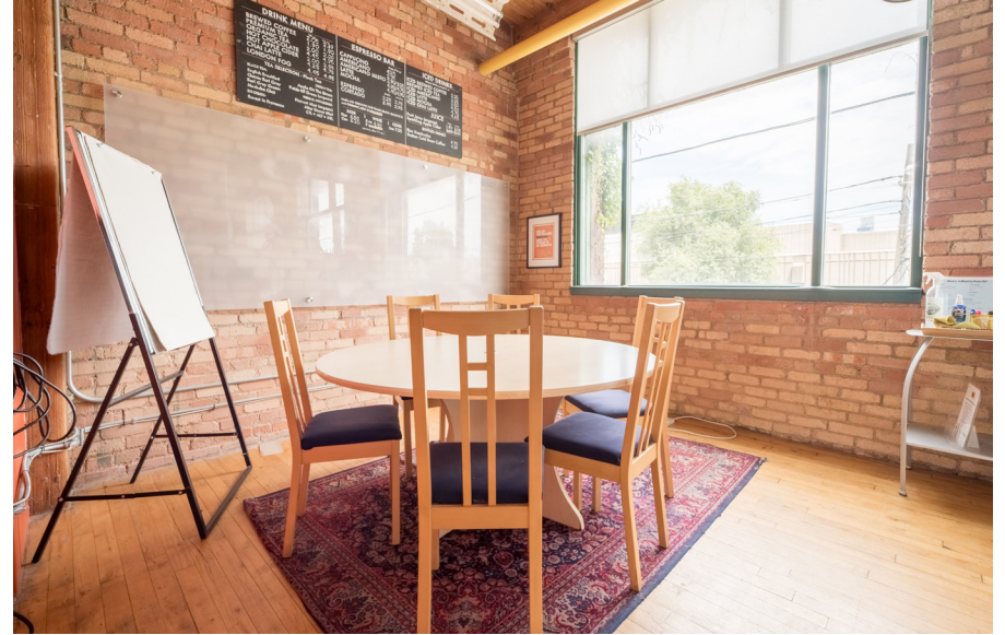
Bookable Meeting Room