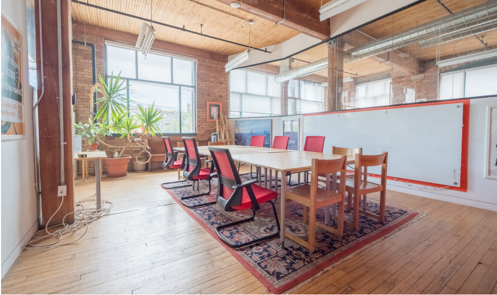
Bookable Meeting Room